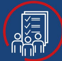
British and European Standard Committees