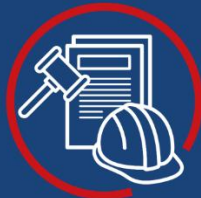
Legislation & Building Regulations